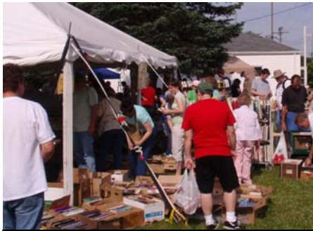
Crowds of shoppers braved the heat at last summer's sale.

We are bigger and better than ever with 7 tents and the Annex at 109 E. Jefferson Street supporting tens of thousands of books and media for our Annual Book Sale in conjunction with Heritage Days. We will start with an Open House Half Price Sale for Members Only on Thursday from 4 to 6 p.m. and will end Saturday from 3 to 4 p.m. with a $3 a bag sale. Please spread the word, bring friends and relatives and check out the bargains.