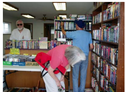
Music CDs, videotapes, DVDs and audio books are also available at the sale.

4:30-5:30 PM Pack and remove unsold books