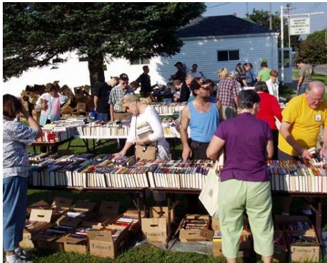
Book Sale location-109 E. Jefferson St., just south of the library.